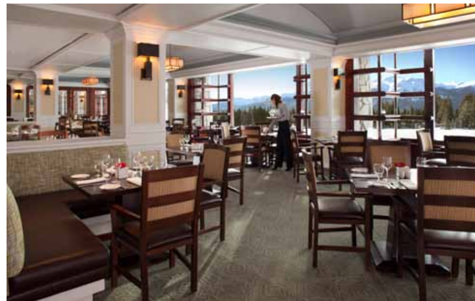
Cavell's Restaurant and Terrace at Jasper Park Lodge