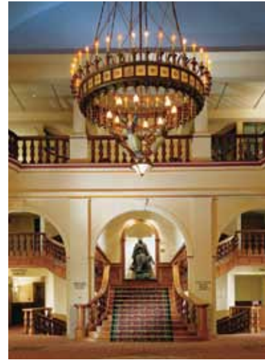
Lobby, The Fairmont Chateau Lake Louise

It's farewell to Jasper as we embark on the next leg of our journey. We travel to Lake Louise where we explore the area. You will be stunned by the surroundings—and we will stop at Athabasca Falls, Peyto Lake, and Moraine Lake.