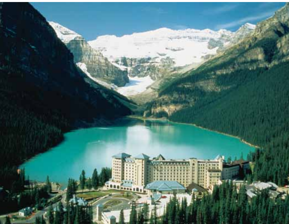
The Fairmont Chateau Lake Louise

All good things must end, and so it is with UNC-TV's Great Canadian Rockies Tour. Still, as you depart from Calgary for the return flight home, you'll leave enriched by the experience, refreshed from what you've seen and done, and filled with memories that are yours to enjoy forever.